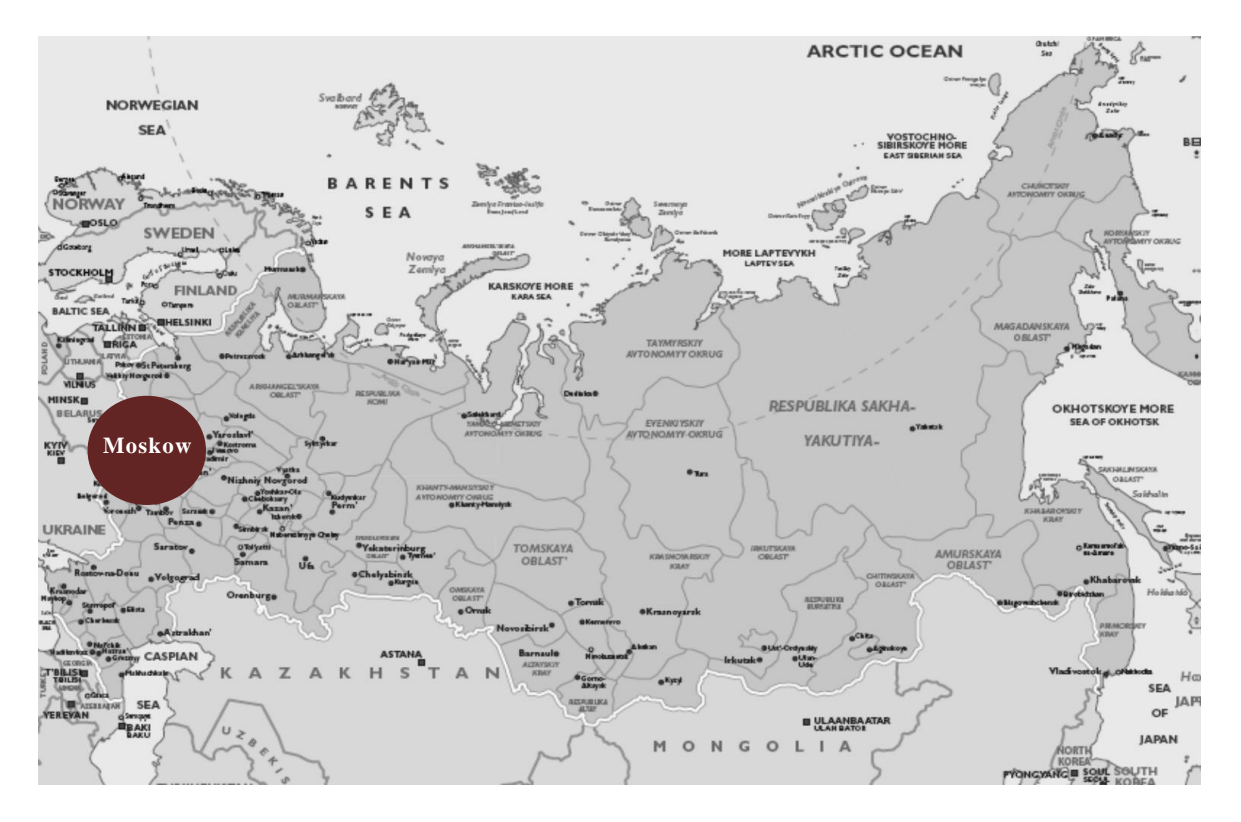
2.3 Tourism Sector in Moscow

Moscow, the capital of Russian Federation has a population around 10.5 million. The city is founded on approximately 1.000 km<sup>2</sup>. The city, which has been founded on the Moscow river in the European side of the city extend towards vast Siberian plains over the Ural mountains on the west and reached Okatsk Sea on the East side.